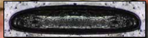
Partial Penetration: Hermetic Venting

Let the experts at LaserSharp FlexPak Services assist you in creating self-venting microwavable packages with added value.